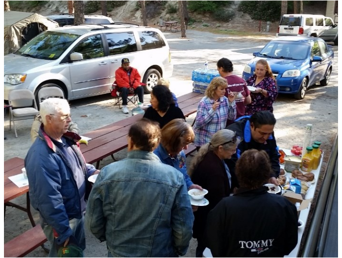
Sunday breakfast another tasty and filling meal to see us home.