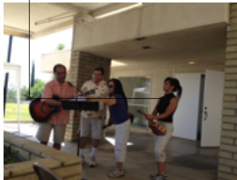
Praise time on Sabbath morning!