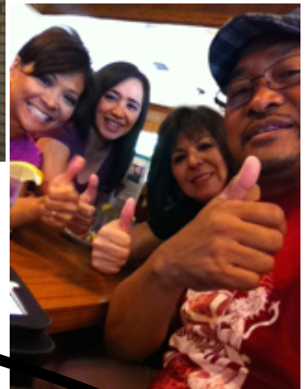
Thumbs up for a job well done!