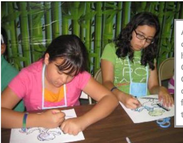
A lot of creativity happened in Crazy Crafts. Coloring, designing and fun happened there.