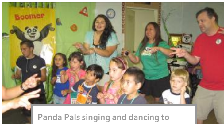
Panda Pals singing and dancing to learn that God is watching over them.