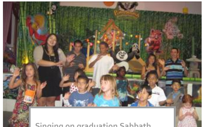
Singing on graduation Sabbath.