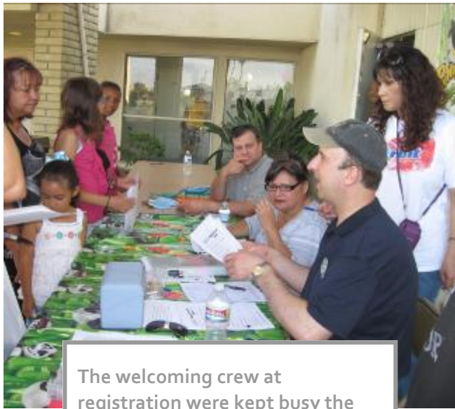
The welcoming crew at registration were kept busy the first night.