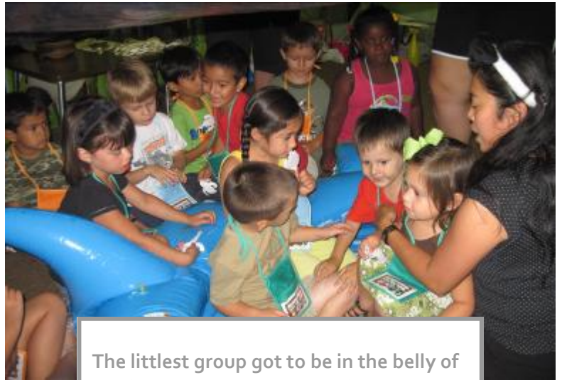
The littlest group got to be in the belly of the fish too, it even smelled fishy.