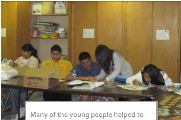
Many of the young people helped to make the signs for the different crews.