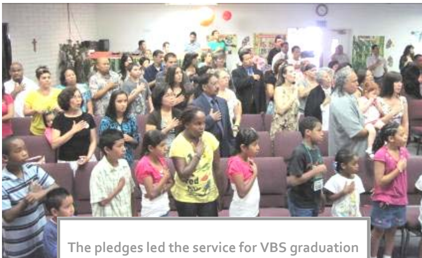
The pledges led the service for VBS graduation on Sabbath.