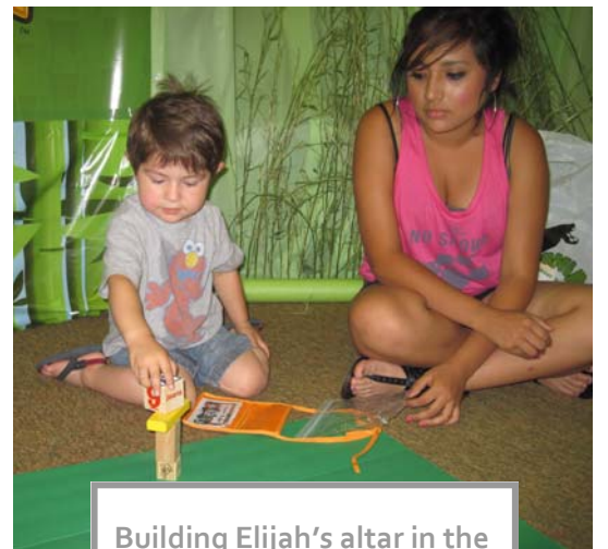
Building Elijah's altar in the Panda Pal's room.