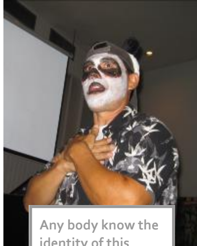
Any body know the identity of this Panda?