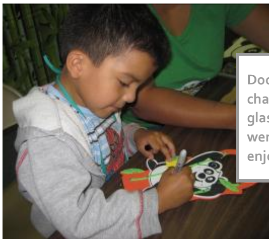
Door hand, key chains , rainbow glasses and more were made and enjoyed.