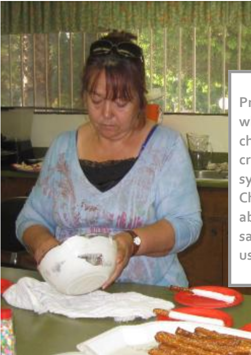
Pretzel and white chocolate crosses symbolized Christ's abundant sacrifice for us.