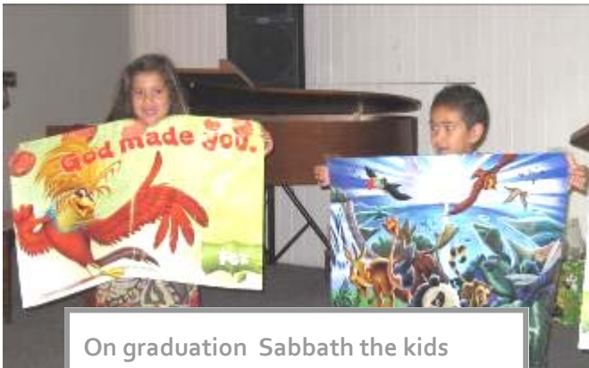
On graduation Sabbath the kids proudly showed what they learned.