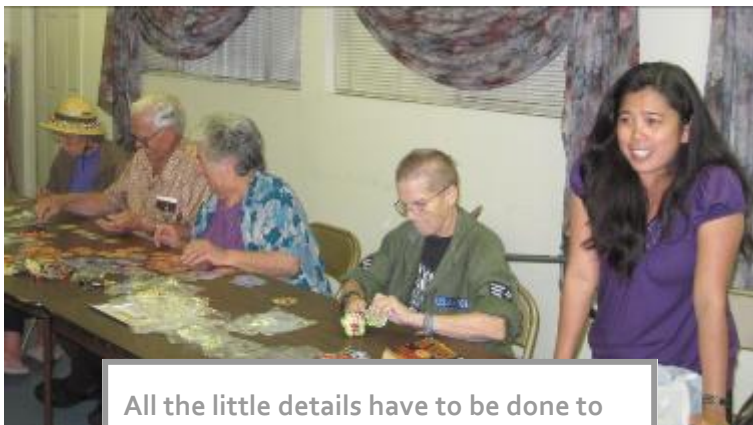
All the little details have to be done to make a successful VBS.